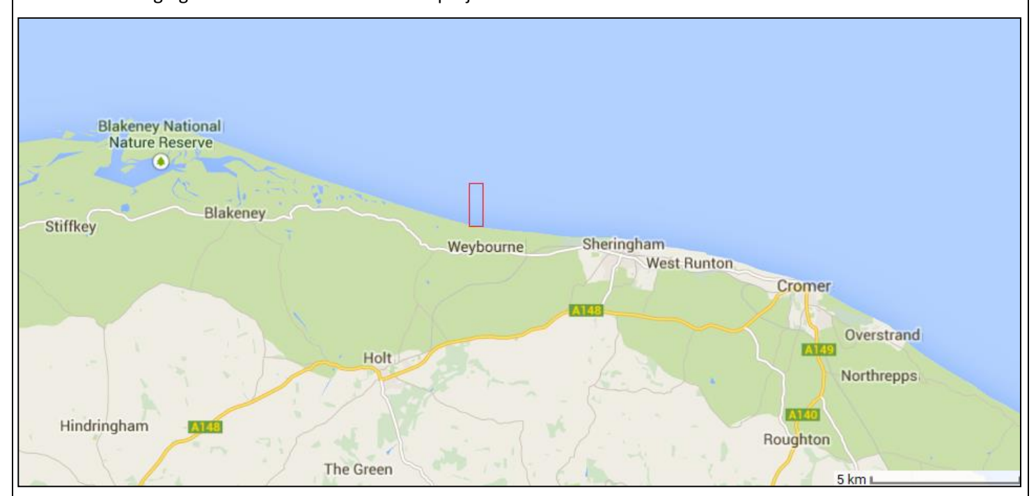
Overview of Project Area

The following figure shows an overview of the project area.